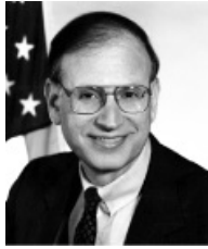
Stuart E. Eizenstat Age 66 Director since 2005 Partner, Covington & Burling LLP

Stuart has been a partner of Covington & Burling LLP in Washington, D.C. since 2001, and heads the law firm's international practice. He served as Deputy Secretary of the United States Department of the Treasury from July 1999 to January 2001. He was Under Secretary of State for Economic, Business and Agricultural Affairs from 1997 to 1999. Stuart served as Under Secretary of Commerce for International Trade from 1996 to 1997 and was Ambassador to the European Union from 1993 to 1996. From 1977 to 1981 he was Chief Domestic Policy Advisor in the White House to President Carter. He is a trustee of BlackRock Funds, a member of the board of directors of the Chicago Climate Exchange and serves on the International Advisory Council of The Coca-Cola Company, on the advisory board of BT Americas Inc. and on the International Advisory Board of GML Ltd. He has received seven honorary doctorate degrees and awards from the United States, French, German, Austrian, Belgian and Israeli governments. He was selected as the best international trade lawyer in Washington, D.C. in 2007 by Legal Times . He is the author of "Imperfect Justice: Looted Assets, Slave Labor, and the Unfinished Business of World War II."